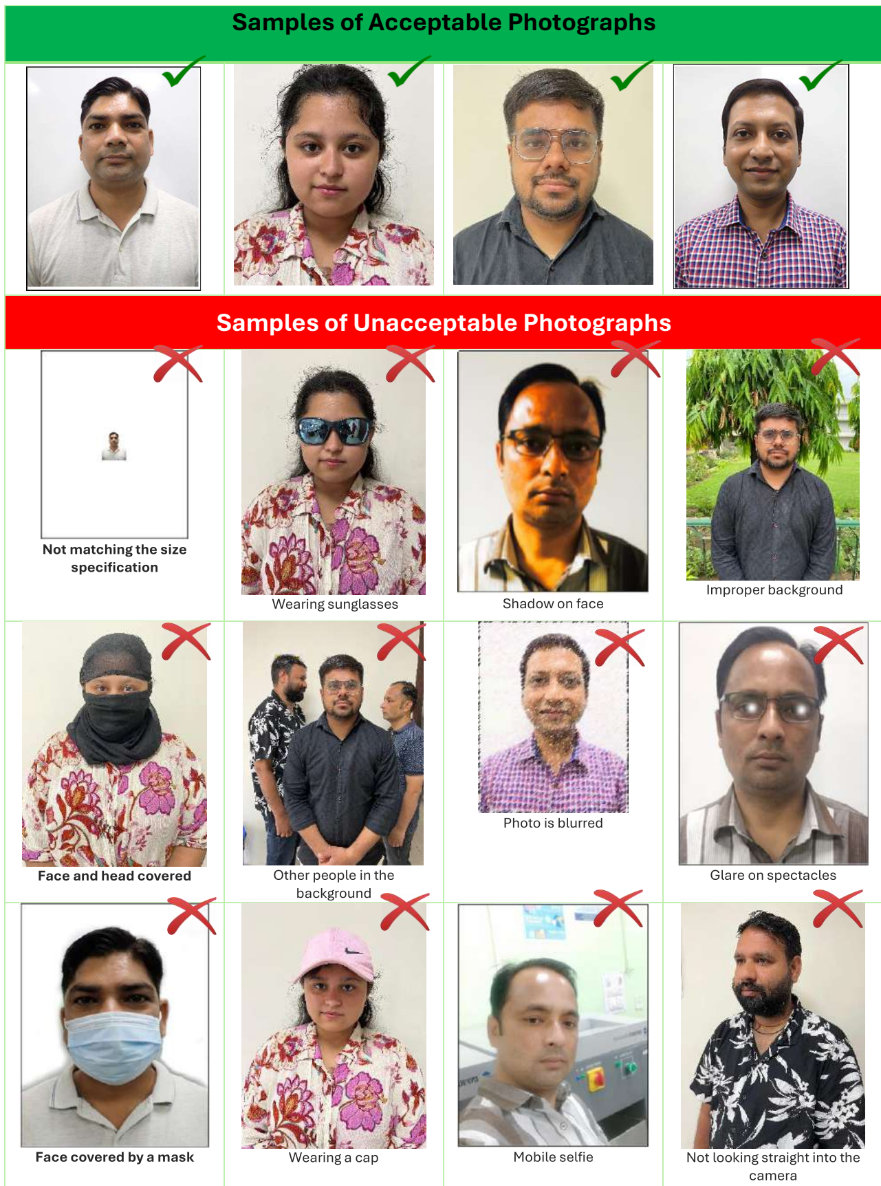
Table 9: Samples of acceptable and unacceptable photographs