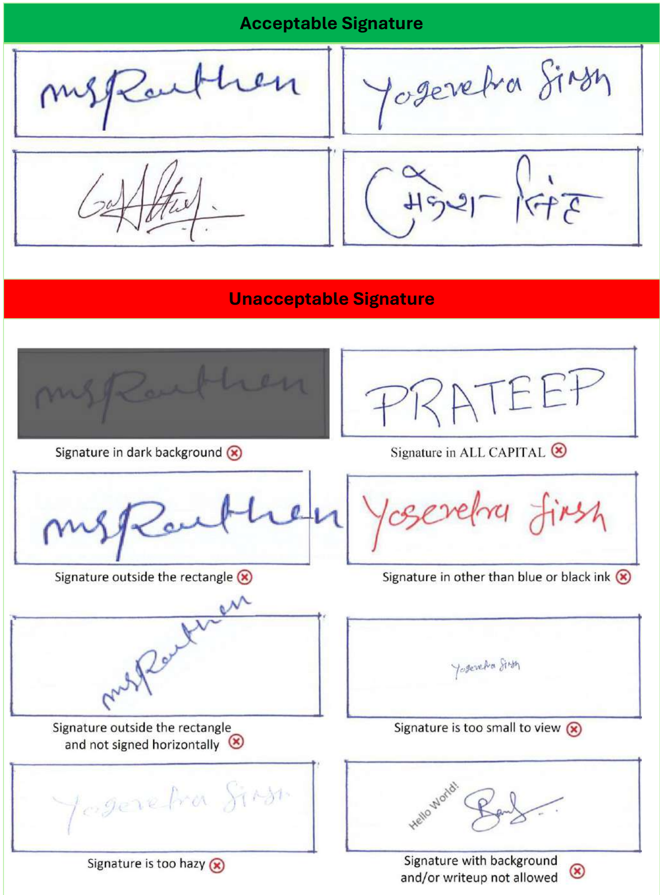
Table 10: Samples of acceptable and unacceptable signatures