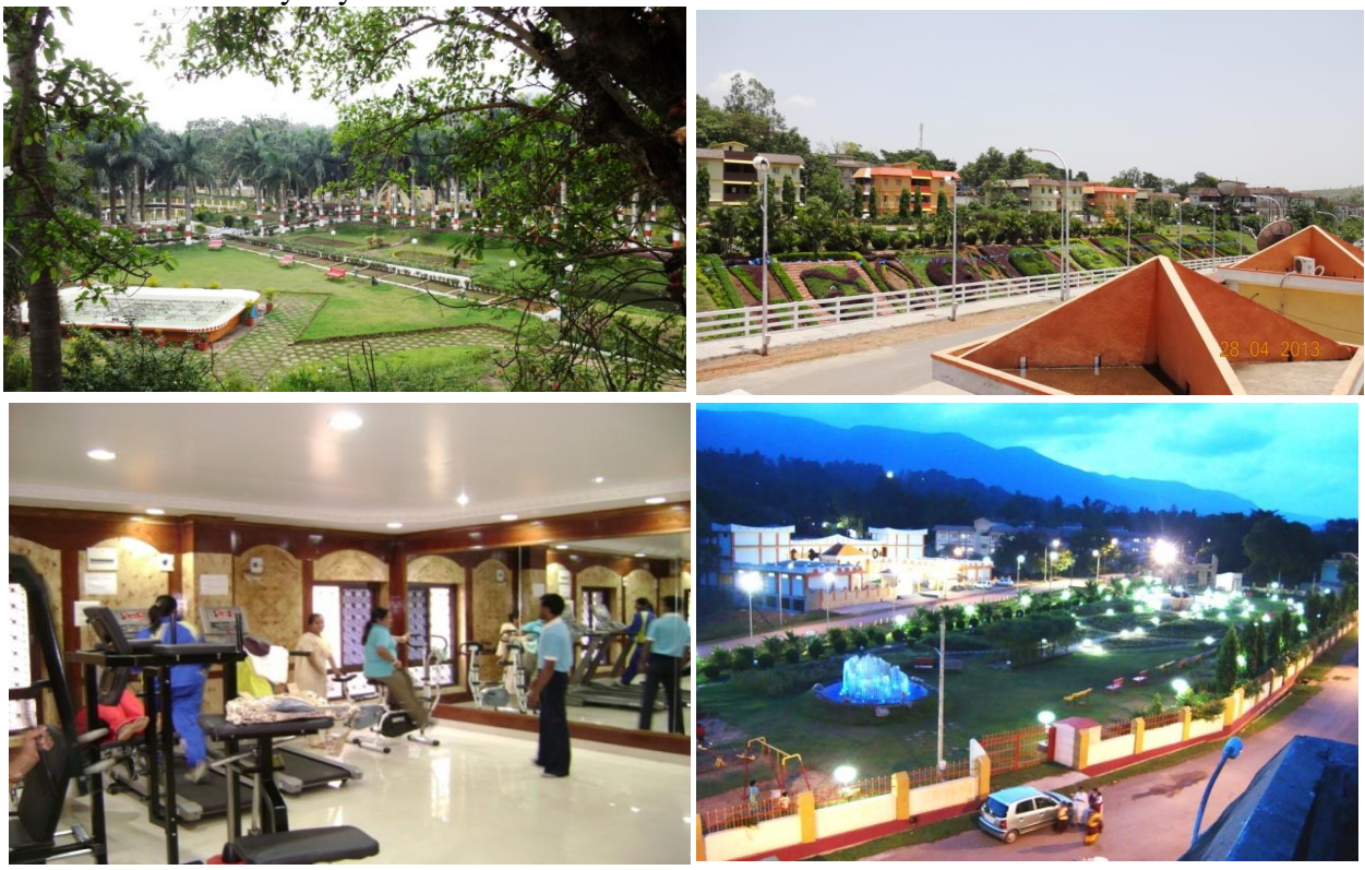
Serving Humanity is Serving Nation

Bacheli and Kirandul Townships at Bailadila Complex are located at the foothills of Bailadila hills surrounded by lush green forest and waterfalls. Bacheli is 30 km from Maa Danteshwari Temple Town / Dist. HQ Dantewada and 120 km from Jagdalpur which is commercial hub of Bastar and is well connected by road and rail to Raipur and Visakhapatnam. The nearest city Jagdalpur is connected by air to Raipur and Hyderabad. The company provides 2 BHK & 3 BHK accommodations with all amenities like 24 hrs water supply, electricity, telephone, security, pick up & drop facilities and supported by in-house maintenance. The company has high class township with all amenities like Shopping Centres, Co-operative Stores, Cafeteria, Function hall, Cultural Associations, Banks, Officers Club with well equipped gymnasium, badminton court, Swimming Pool, Parks, CBSE schools like Kendriya Vidyalaya, DAV Public School up to XII std, ICSE school Prakash Vidyalaya.