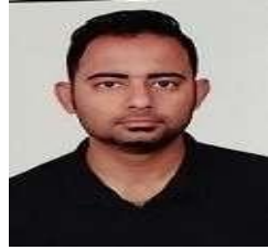
Samples of photographs which are not acceptable